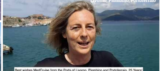
Livorno, Piombino, Portoferraio