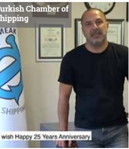
Turkish Chamber of Shipping

From the Adriatic Central ports, best wishes MedCruise!