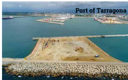
Port of Tarragona