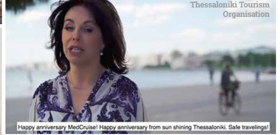
Thessaloniki Tourism Organisation

Happy anniversary MedCruise! Happy anniversary from sun shining Thessaloniki. Safe travels!