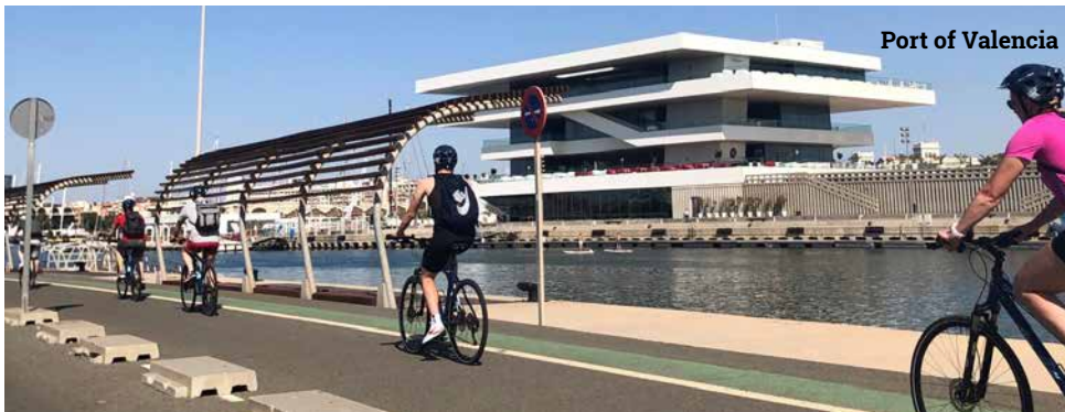
Port of Valencia