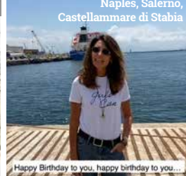
Naples, Salerno, Castellammare di Stabia