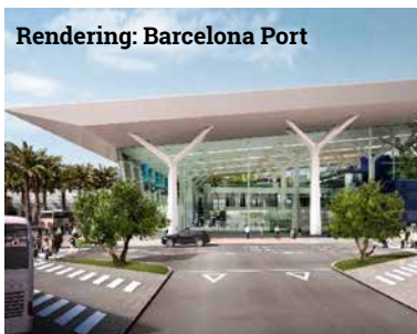
Rendering: Barcelona Port

Conesa noted the location of the new building, which will be the sixth terminal at Adossat Quay. It follows an agreement in January 2018 made between the port and Barcelona's municipal government allowing the relocation of all cruise operations from the north and south terminals near the city centre. Mar Pérez, mar.perez@portdebarcelona.cat