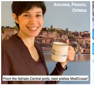
Ancona, Pesaro, Ortona

Happy anniversary MedCruise! Happy anniversary from sun shining Thessaloniki. Safe travels!