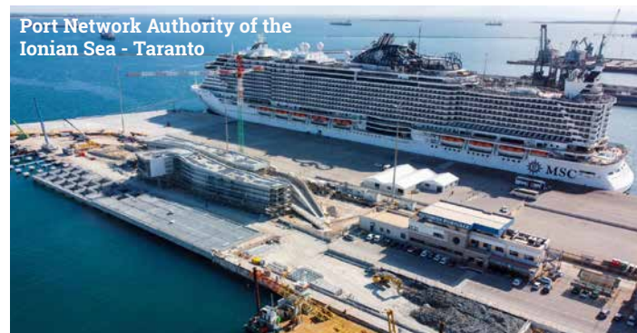
Port Network Authority of the Ionian Sea - Taranto