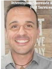
Intercruises Shoreside & Port Services